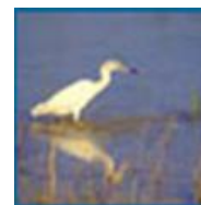
North East Lindsey