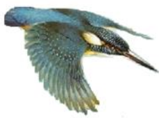
Witham First District IDB

Witham House, J1 The Point, Weaver Road, Lincoln LN6 3QN Tel: 01522 697123